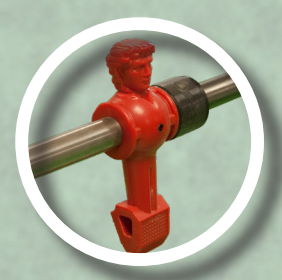
Counter-balanced men designed for superior strength and durability